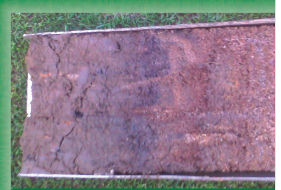
Dead soil of with excess thatch iron bands, black laye compacted soil, no life and no roots.

To apply 100Kg N per hectare as ammonium sulphate means you apply a salt equivalent of about 350Kg. Iron accumulation is partly responsible for the black compacted soil, iron bands, aggregated fines forming root breaks and concentrations of iron oxides familiar to all green keepers. In excess it has fungicidal properties and as we shall see beneficial fungi are essential for fine grasses, root growth, nutrient retention, low disease and